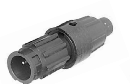
Cable to Cable 1828X-XXB-XXX Matching Mates: • Cable Pin 1628X-XPB-XXX • Cable Socket 1628X-XSB-XXX