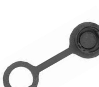
Dust Cap 16295