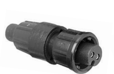
Cable Socket 1628X-XSB-XXX Matching Mates: • Cable-Cable 1828X-XPB-XXX • Panel 172XX-XPB-XXX